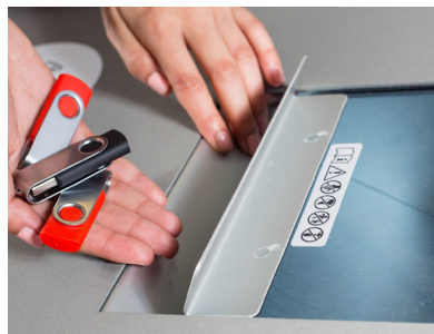
SSDs, USB sticks, SD cards, and plastic cards are rendered unusable