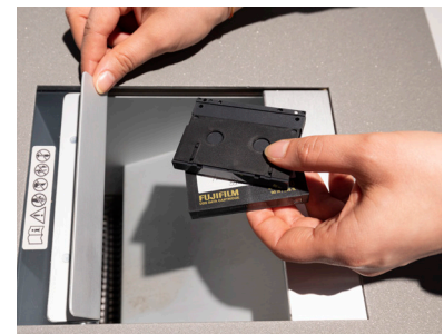
Small magnetic tapes, as well as CDs, DVDs and Blu-rays are shredded